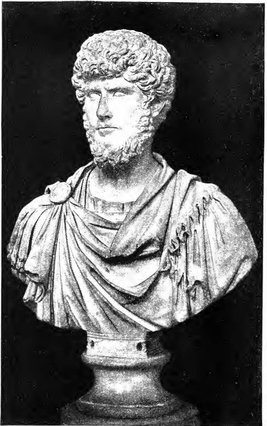
The Emperor Marcus Aurelius